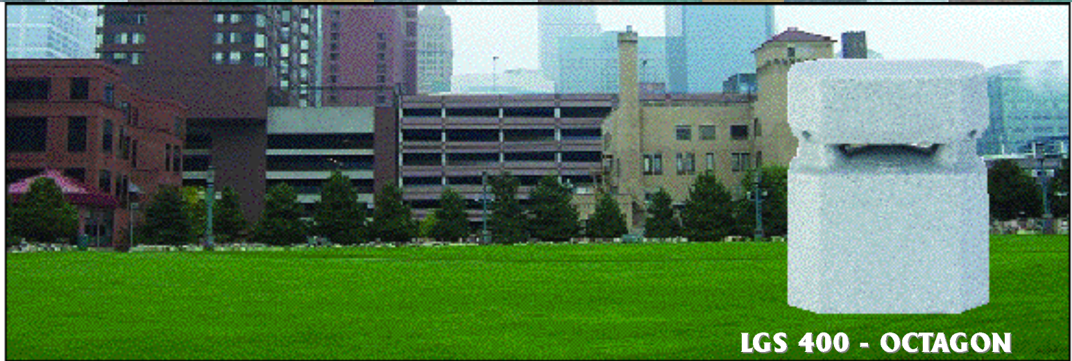
LGS 400 - OCTAGON