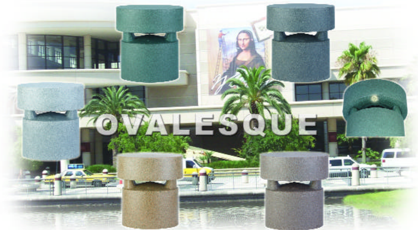
LGS OVALESQUE DIMENSIONS: 17"L X 13.5"W X 17.5"H