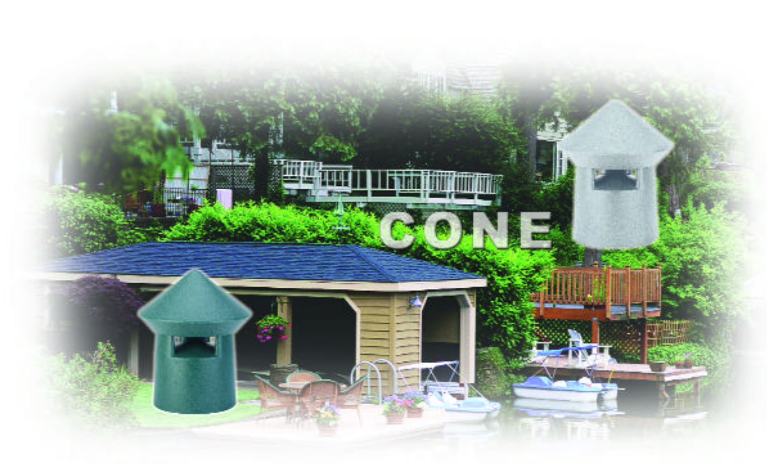
LGS CONE DIMENSIONS: 15"L X 15"W X 17.5"H