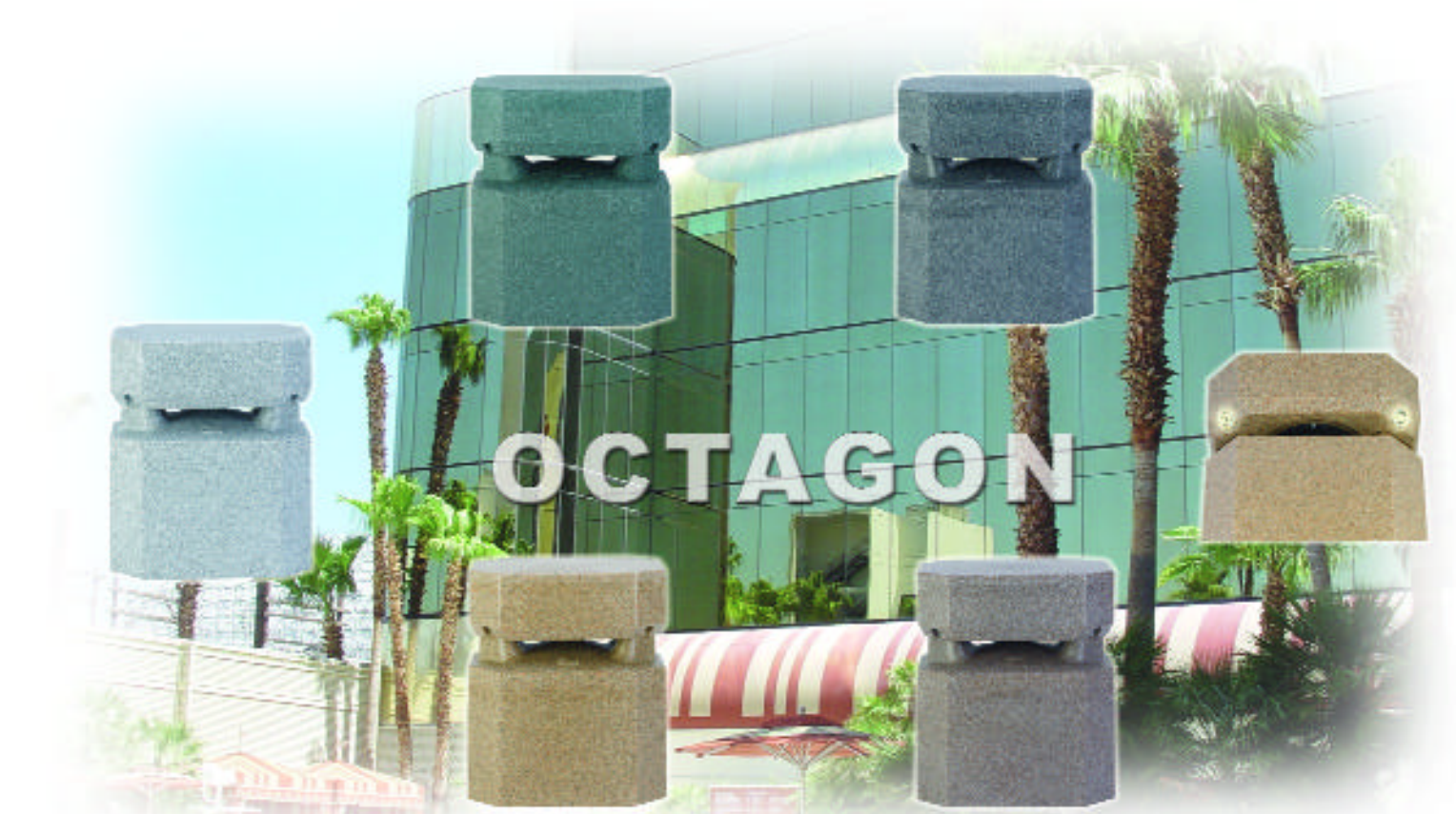
LGS OCTAGON DIMENSIONS: 13.5"L X 10"W X 16"H