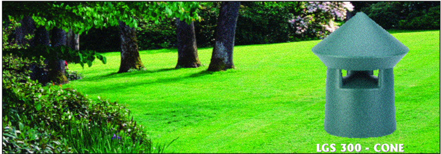
LGS 300 - CONE