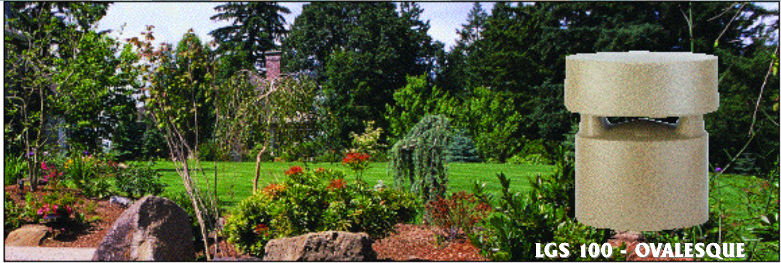
LGS 100 - OVALESQUE